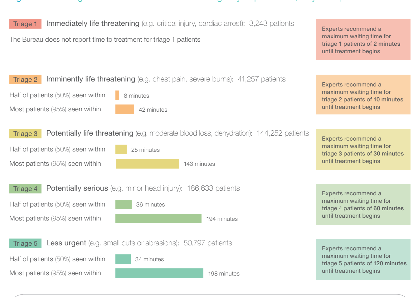
Figure 4: Waiting times for treatment in NSW emergency departments, July to September 2011

Note: Treatment time is the earliest time recorded when a healthcare professional gives medical care for the patient's presenting problems.